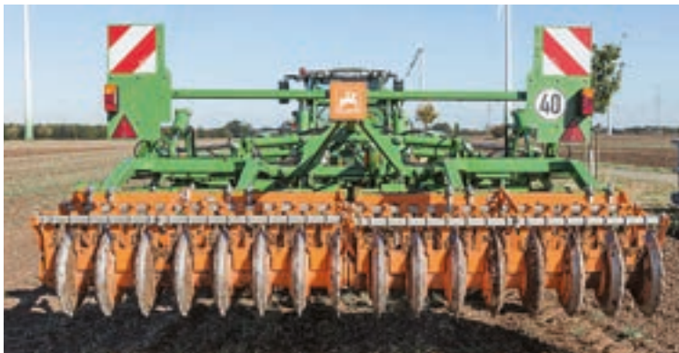
The double-disc roller put in an excellent performance on our heavy soils.

16l/ha. The Amazone also put in an excellent performance in maize, with the front end chopping up the stubble and the tines mixing it in.