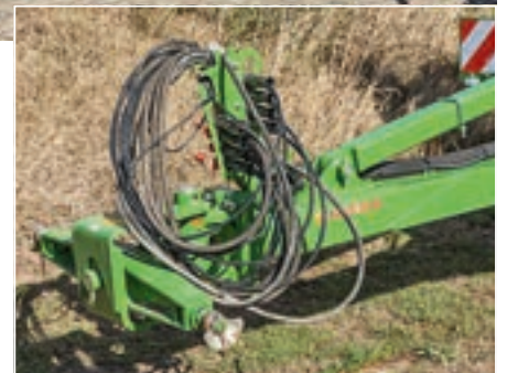
The long drawbar enables tight turns, even with dual wheels fitted. We like the hose holder and large storage box.