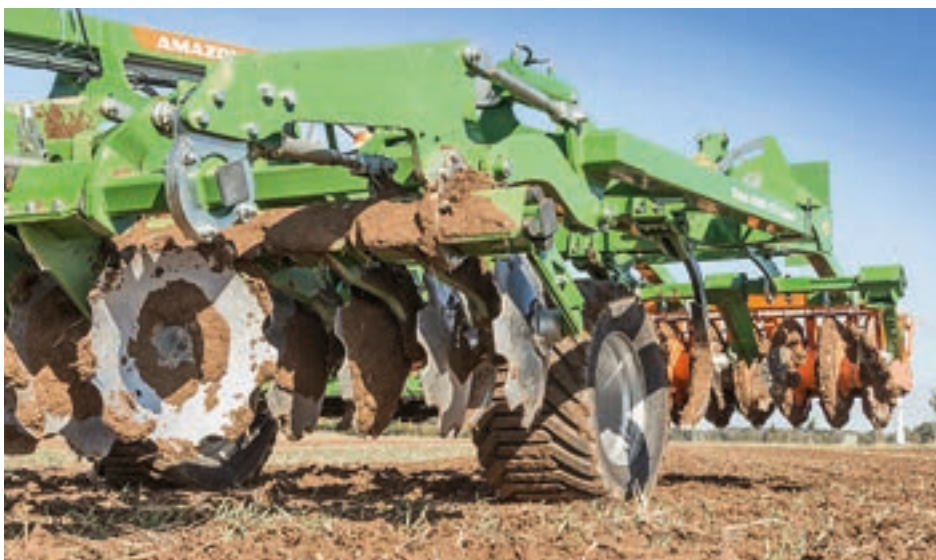
The discs cut and distribute the trash, while the following tines incorporate the chopped material. The mid-mounted running gear makes the Ceus very manoeuvrable on the headland and through gates etc.

Rubber cord sausages look after break-back. The maintenance-free disc bearings are bolted to the arm. Disc spacing on the same gang is 250mm; disc-to-disc spacing is 125mm.