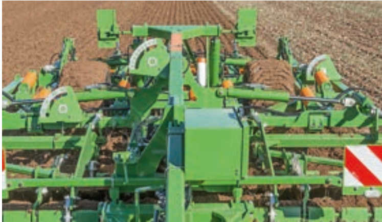
The working depth of the various tools is clearly shown on durable scales.