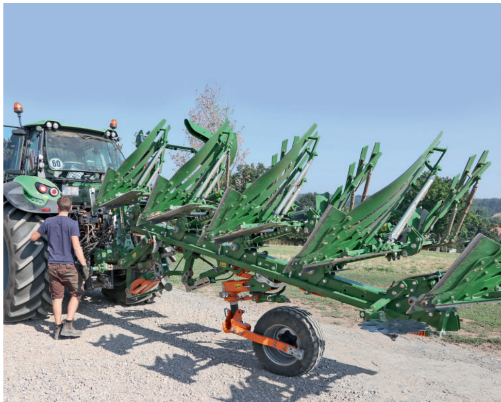
Transport / work changeovers are quick and straightforward by refitting two pins on the combi wheel.

And with the share point covering the front end of the wing, no trash can build up