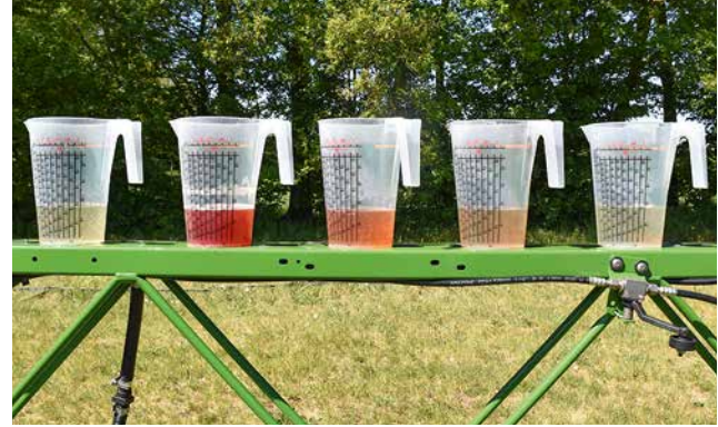
△We tested the efficiency of the system clean feature with beet root juice. The water in the left jar was sampled before the experiment, the right jar afterwards.

On the whole, Amazone offers a host of options for its mounted sprayers, and this is reflected in the price. For example, the price for our UF 1302 in test specification with the options mentioned and 21m boom is €49,970. By comparison, the top model, the UF 2002 with 30m boom in high-end specification, costs €70,000. But there is also a much less sophisticated and low-