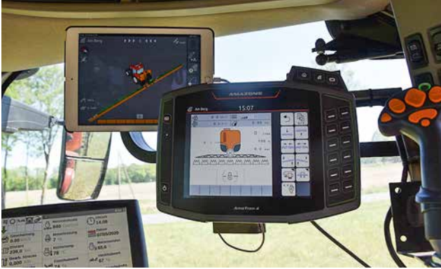
△The map view can be transferred via Bluetooth to a tablet, for example – courtesy of the new AmaTron Twin app.